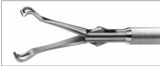
Endo. Babcock Grasping Forceps