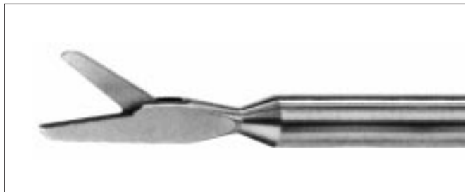
Heavy Duty OP Scissors 10mm