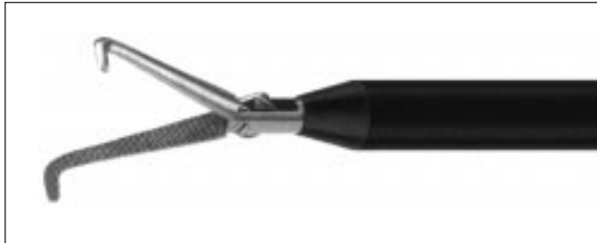
Mixer Dissector 90°