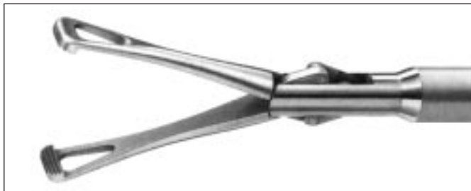
Endo. Duval Grasping Forceps