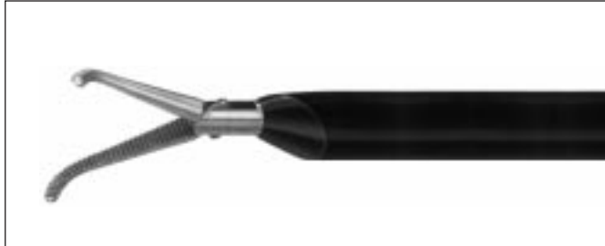
Mixer Dissector 45°