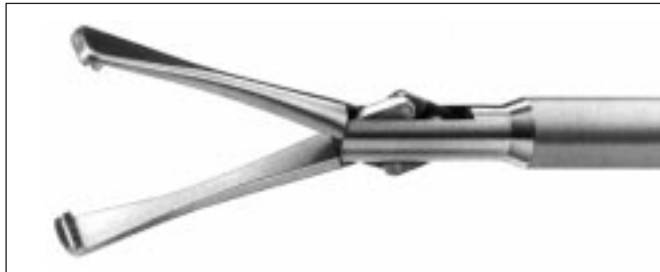
Endo. Debaquey Allis Forceps